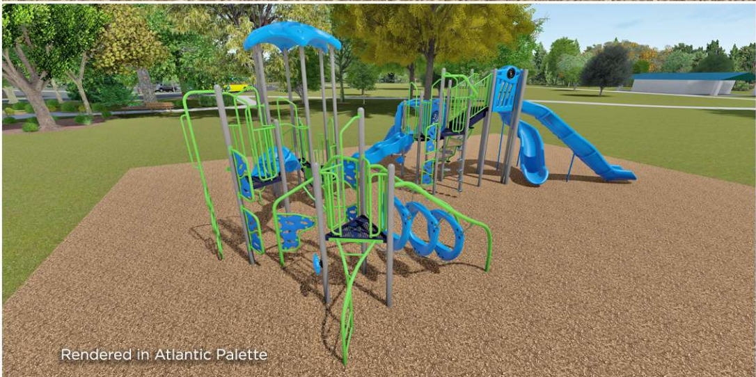
Rendered in Atlantic Palette